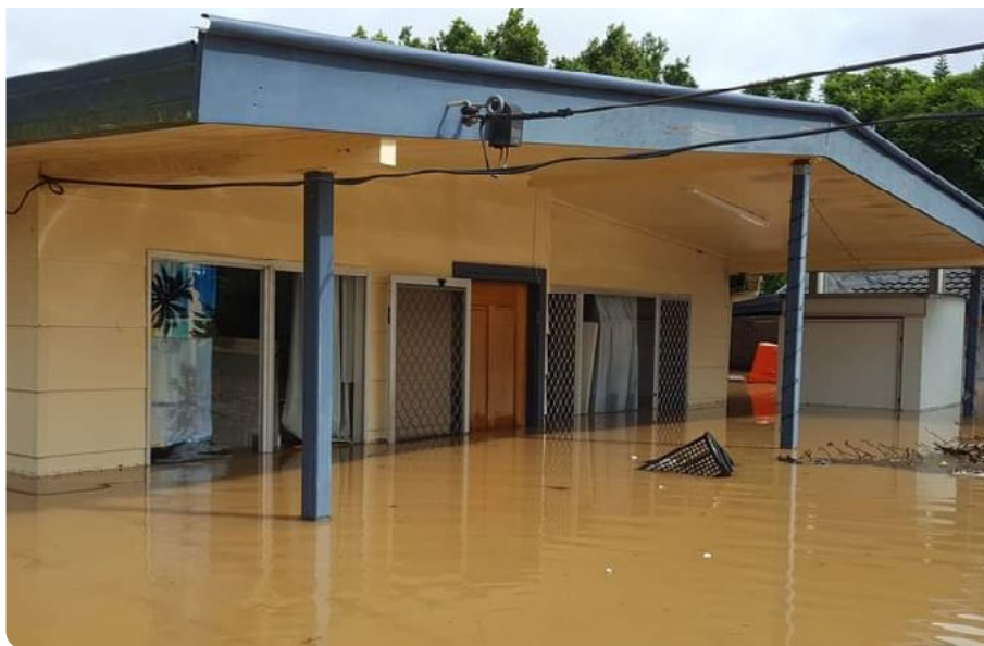
Above: Flooded homes in Queensland.

These considerations provide nuanced guidance on how specific resilience programs play out within their own physical, financial, social and emotional contexts. These nuances are important in evaluating the progress and outcomes of any resilience program, going beyond identifying the number of houses completed. The framework and considerations developed can be used to expand the body of knowledge around post-disaster resilience in the context of government-sponsored resilient housing programs.