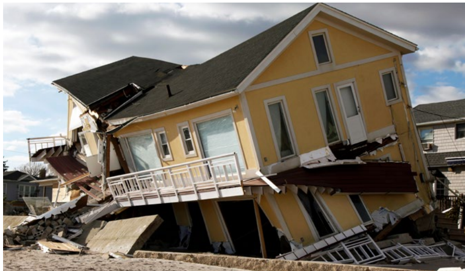
Above: Hurricane Sandy destruction.

Understanding how resilient housing programs change the lives of households and communities is essential not just for Queensland and Australia, but globally as authorities search for ways to manage climate impacts and reduce the devastating damage and loss to homes from weather disasters.